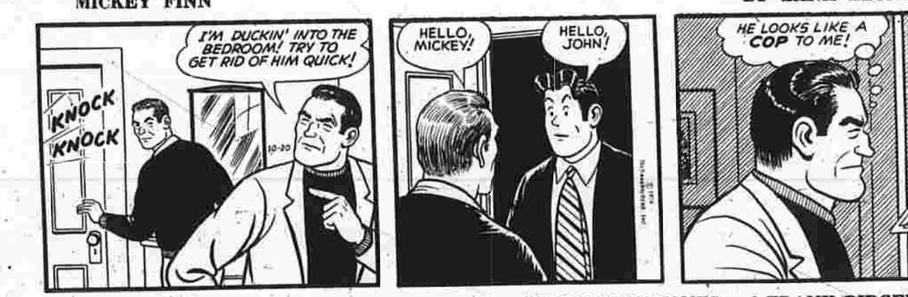
MICKY FINN BY LANK LEONARD