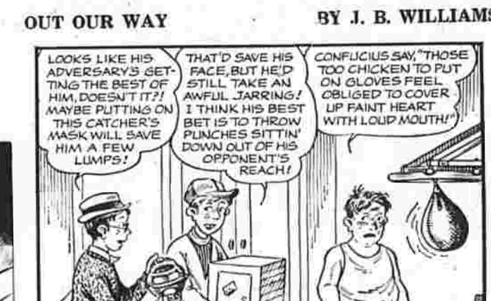
OUT OUR WAY BY J. B. WILLIAMS