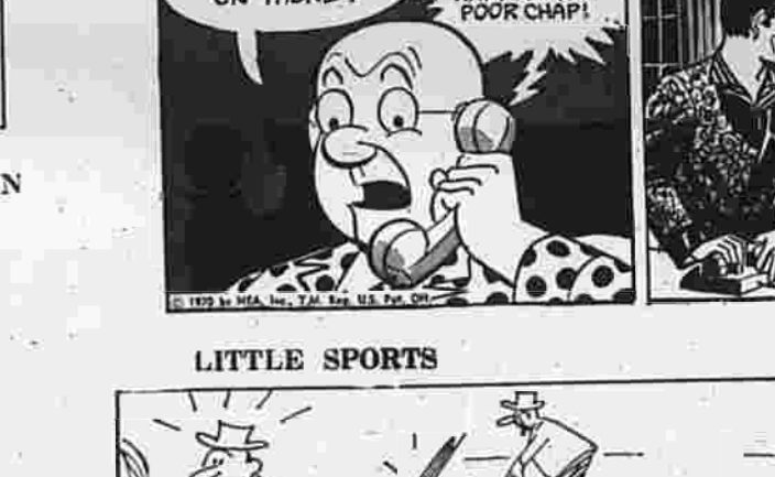
LITTLE SPORTS BY ROLSTON