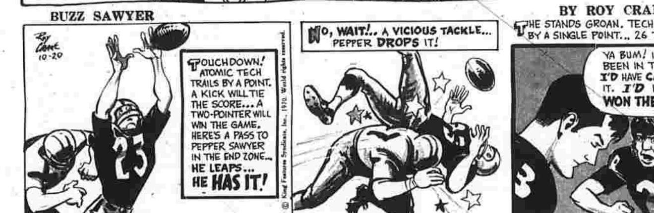
BUZZ SAWYER BY LANK LEONARD