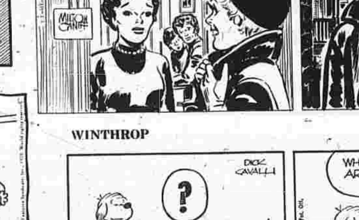
WINTHROP BY DICK CAVALI