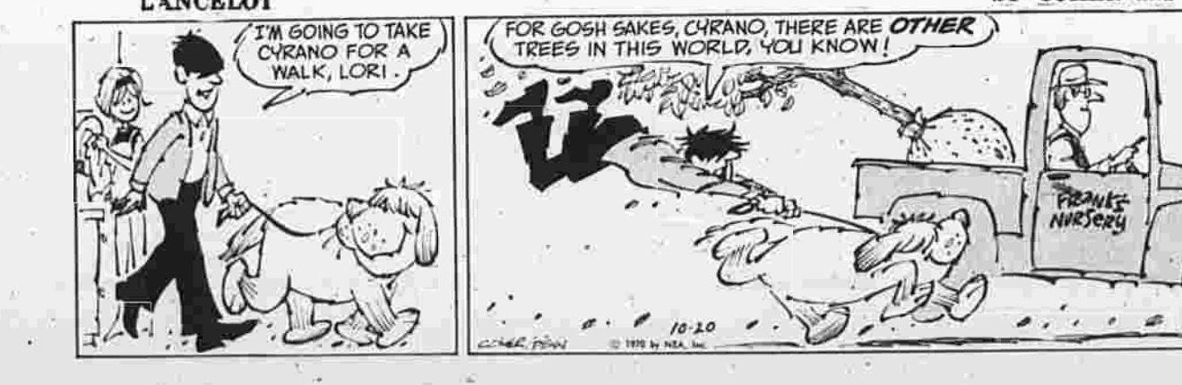
LANCLOI BY COKER and PENN