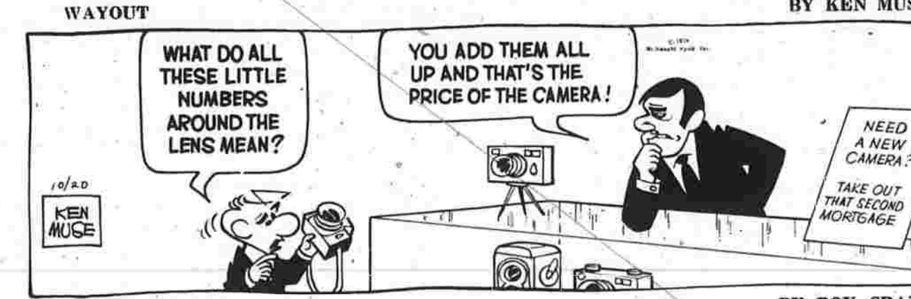
WAYOUT BY KEN MUSE